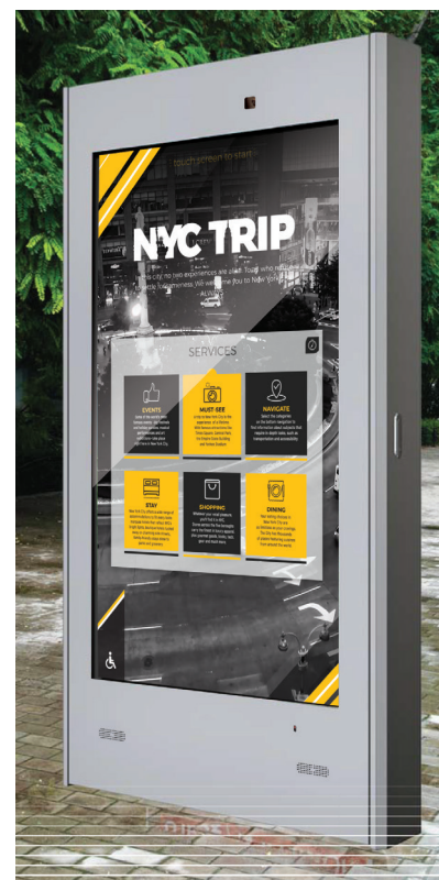
Single Sided Model Shown (EN75ST)

Specifications are subject to change without prior notice.