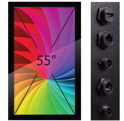
Shown in Portrait