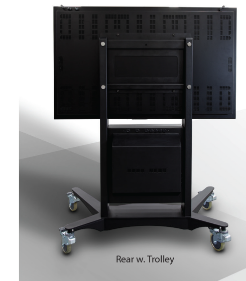
Rear w. Trolley