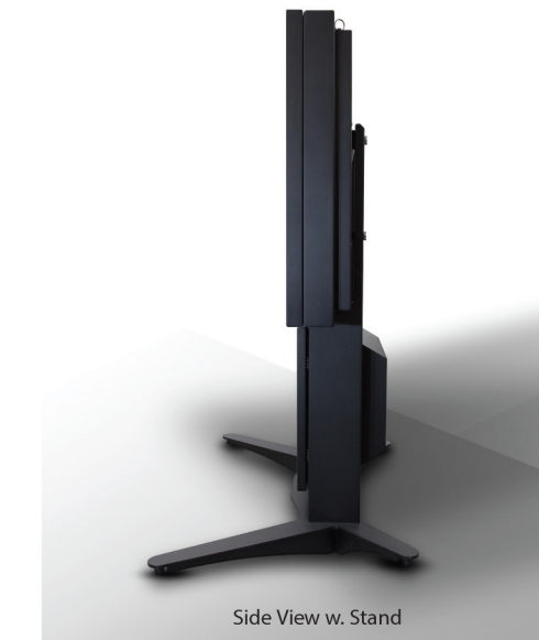
Side View w. Stand

IP65 RATED OUTDOOR ENCLOSURE • SINGLE SIDED DISPLAY • PATENTED AIR COOLING SYSTEM • 10-POINT CAPACITIVE TOUCH INTERACTIVITY